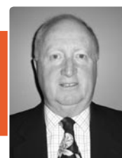
Article by Herb Martin

This article describes the efforts that are underway to create a standardized healthcare supply chain in Canada, affecting change and eliminating obstacles that have prevented full adoption in the past. Recent developments will accelerate the creation of one of the most modern supply chain systems in the world, with the full involvement of the government, healthcare provider (i.e. hospital), supplier, group purchasing organizations (GPO), and service provider communities.