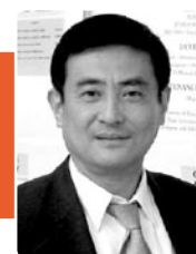
Article by Liang Yan

This article discusses the distribution and traceability model of Implantable Medical Devices (IMD) for post-market surveillance purposes, and the IT and automatic identification technology that has been used in the supply chain to complete post-market tracking in Shanghai. To build up this system successfully, it was necessary to establish a Unique Device Identification (UDI) for IMD's, based on GS1 Standards, to define the minimum information in the tracking process, and to establish a central data pool to support automatic reading in the hospital management system. Meanwhile it is necessary to have a Shanghai FDA monitor platform to collect the traceability information from the end user. This article also contains a real case study that took place in Shanghai.