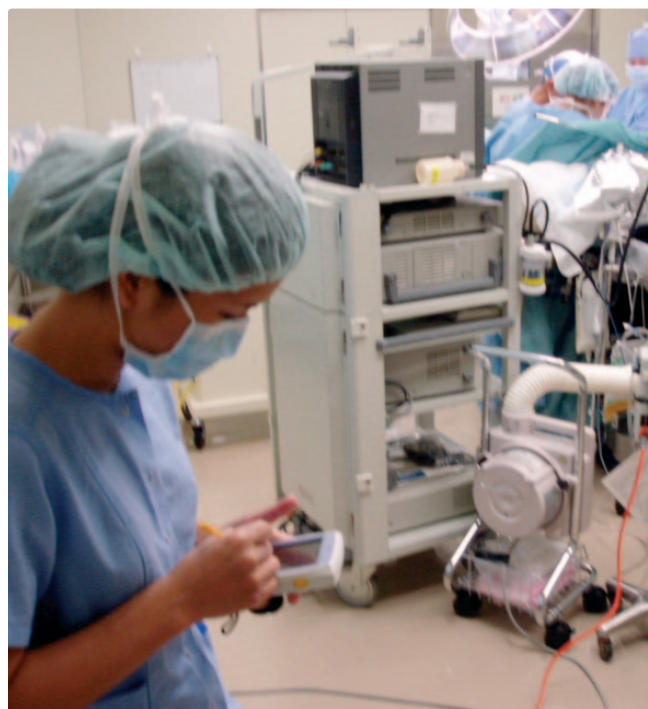
Fig. 3 Operating Room Support System

The scheduled operations for that day are transmitted to the PDAs. This information is checked against the barcode on a patient's wristband to verify those who are scheduled for surgery. Barcodes for medications and medical/surgical materials are internally integrated GS1-128 barcodes issued from the distribution system. During the operation, scrub nurses record implementation information by scanning each barcode of every medication and medical/surgical material used (Fig. 3).