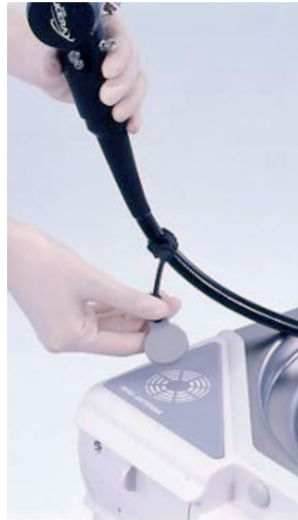
Fig. 4 IC tag attached to endoscope

Many commercially available electrocardiograph monitors are huge in size, which can sometimes lead to significant difficulties in shifting the equipment in the event of an emergency or in using it in a cramped environment. Therefore, the hospital has introduced a system where a PCI card with electrode cables is inserted into PDA slot this enables 12-lead electrocardiograms. The cardio graphic record once stored in the PDA can easily be transferred to the EMR system. The physiological laboratory operates a system where patients' electrocardiograms when at rest can be easily viewed and compared to those taken during an attack via the Web server.