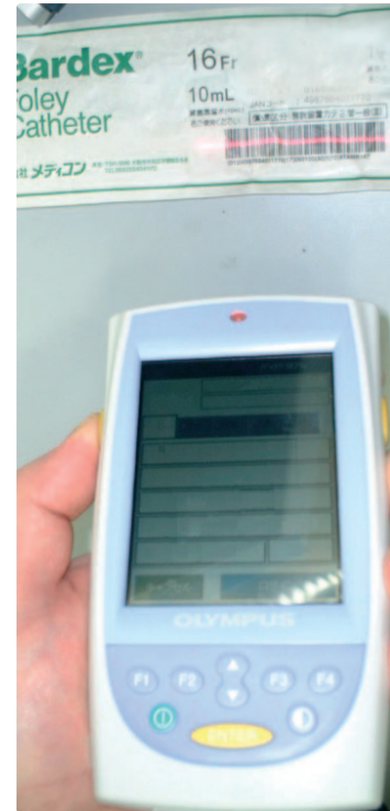
Fig. 5 Application of PDA for distribution system