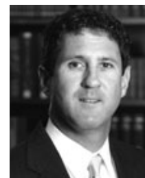
By Jay Crowley

If used by all healthcare stakeholders, UDI can improve visibility of device movement, recalls, post-market surveillance, adverse-event reporting, and anti-counterfeiting, among other benefits. A properly implemented UDI will also facilitate the integration of medical device data across disparate IT systems, including those that support the supply chain, clinical and reimbursement functions.