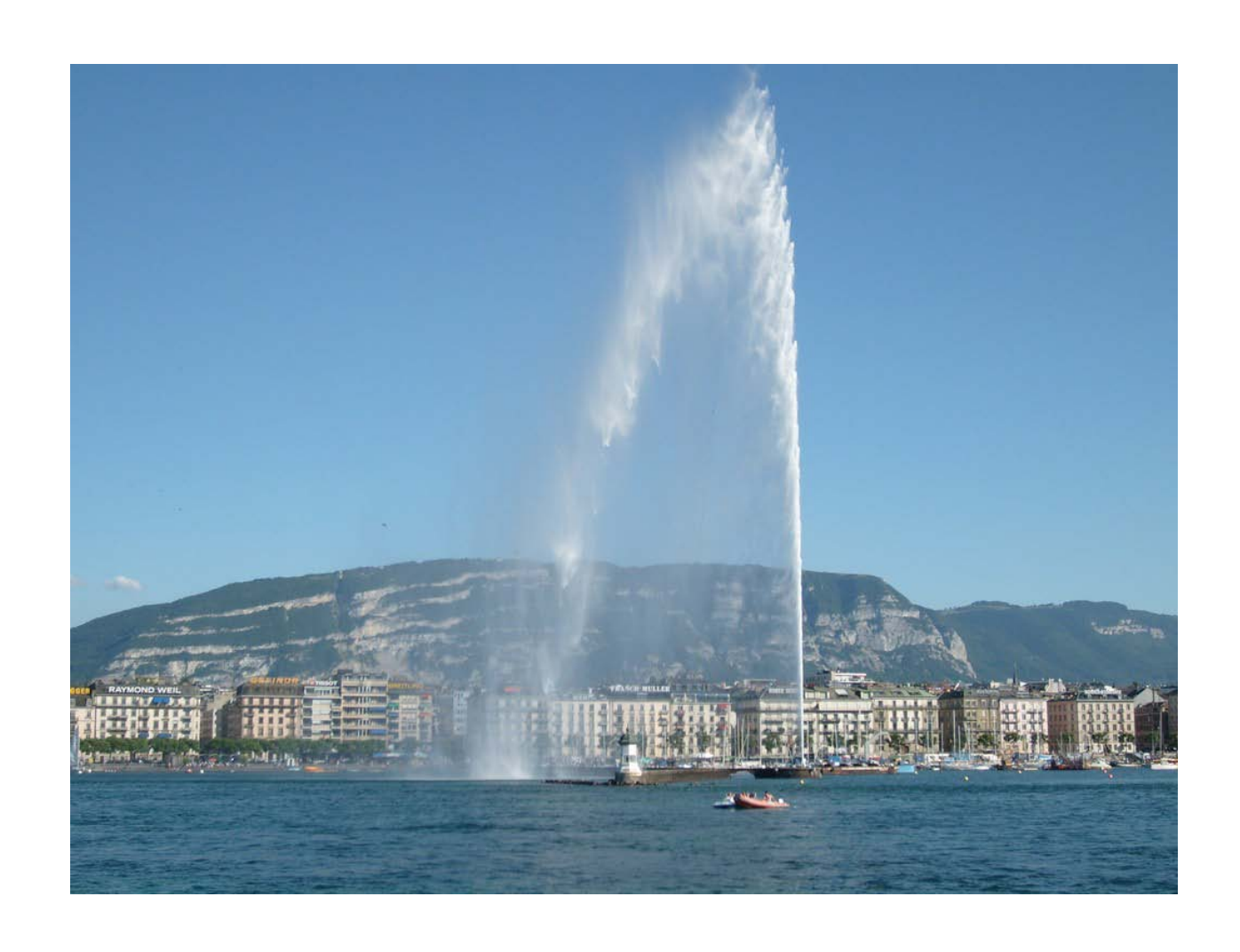
22-24 June 2010 Geneva, Switzerland