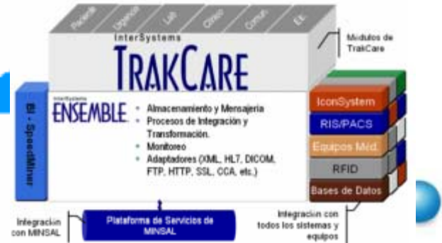
Figura 5-12 - Arquitectura de TrakCare (basada en Ensemble)