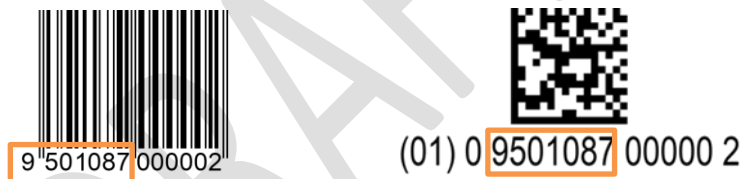
Examples of EAN-13 and GS1 DataMatrix with a 7-digit GCP

Although a GCP is a licence to create GS1 identification keys it is not an identifier of the company to whom it has been issued and cannot be used as an identifier of a company (i.e., manufacturer, distributor, hospital, health system, clinic etc.). The Global Location Number (GLN) identifies a company within the GS1 system of standards.