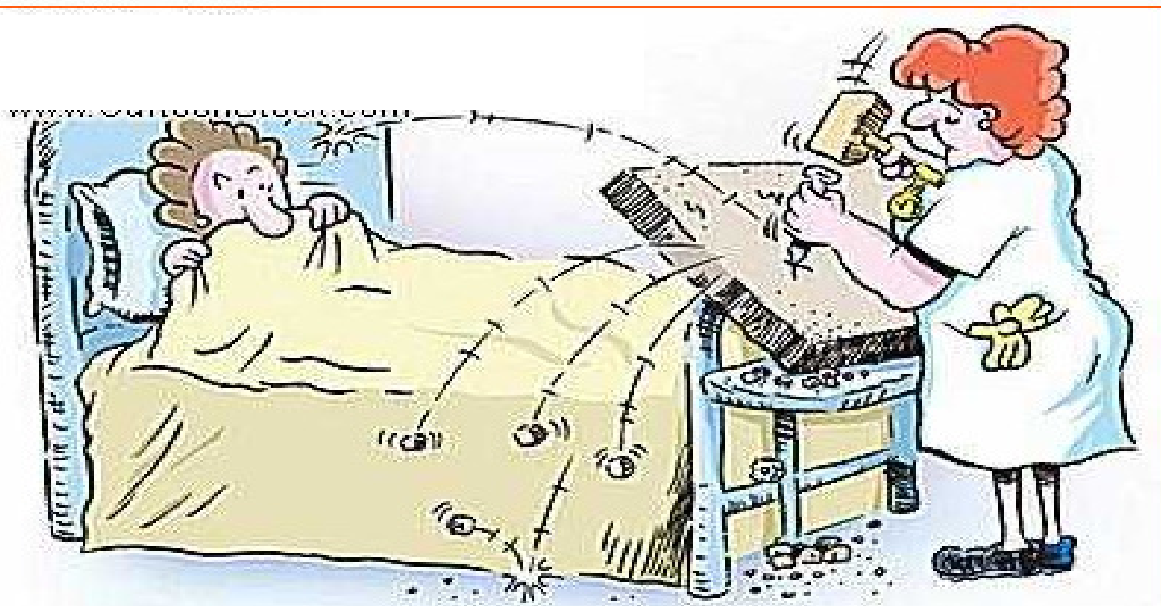
Nursing notes before the computer.