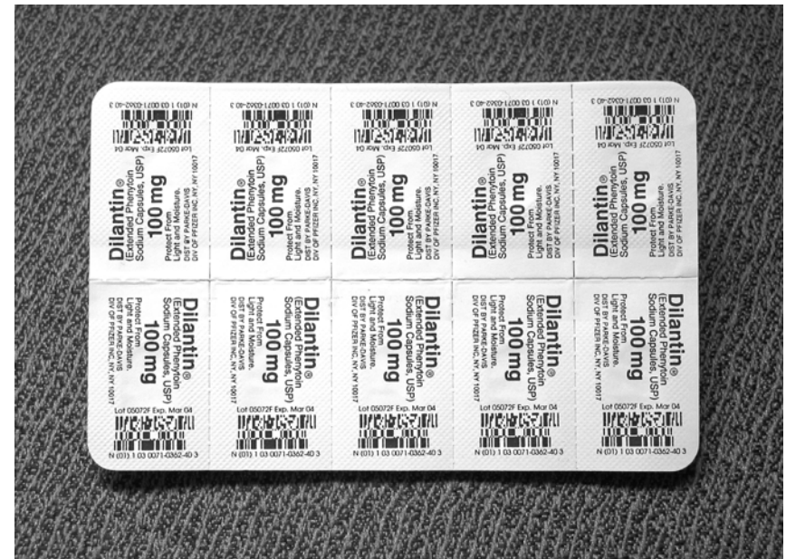
Hospital Unit Dose Blister Reduced Space Symbology with Composite Code

« GS1, a new name, a global vision together »