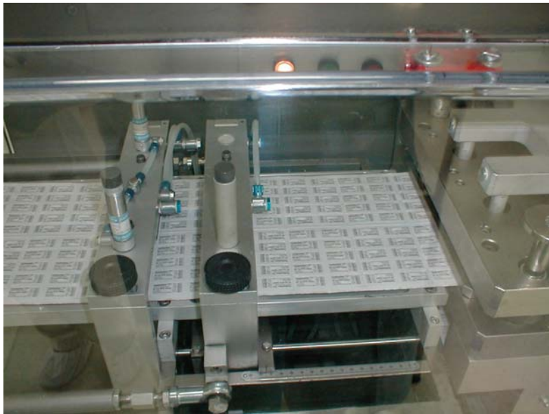
On Line Platen Printing