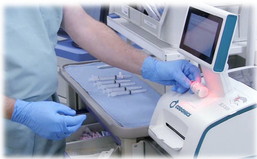
High risk medication