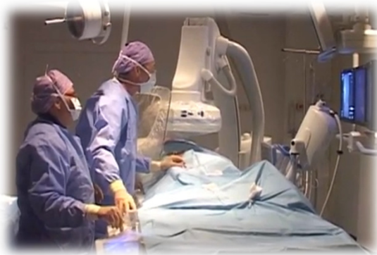
Cardiac Catheterisation Rooms & Interventional Radiology department